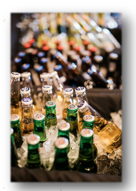
Keg Beer Please inquire for pricing

Wine Offerings Don't see the selections you would like to have available? We can bring in just about anything you would like to offer, just ask. Items will be priced accordingly by the club.